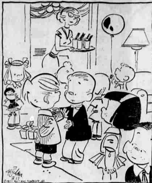
...AND IF I LIKE THE FOOD, AND IF I WIN A COUPLE OF THE GAMES, THEN YOU GET YOUR PRESENT.