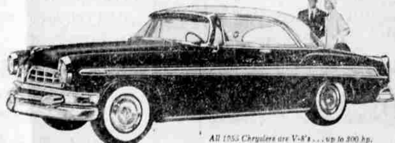
All 1955 Chryslers are V-8's... up to 300 hp.

USED CAR BUYERS! Our "Pentastar Winners" include many late model Chrysler cars. Compare the values!