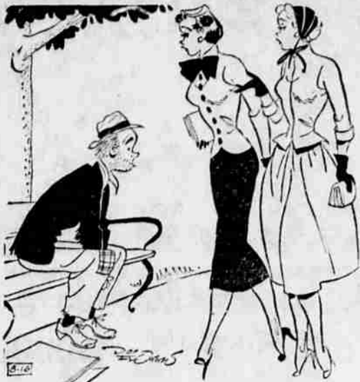
"He was a big man in TV. But nothing he ever said reflected the opinion of his sponsors!"