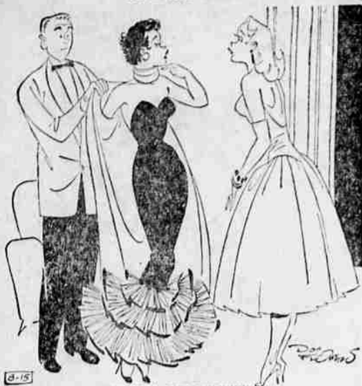
"Bad cold. Sore throat."