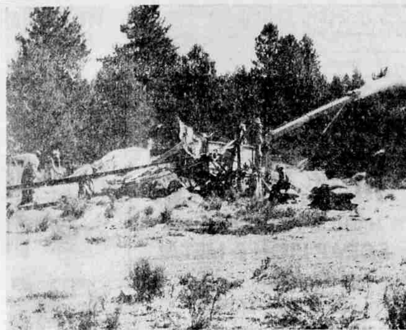
A NOSTALGIC RETURN to the early 'thirties' is represented in this picture of an old time threshing machine doing modern work by threshing Marion bluegrass seed on the Ed Geary ranch.