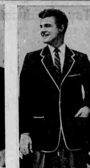
GRAY WOOL flannel blazer is a school tradition. Piped in light blue braid, it's also resort spot wear.