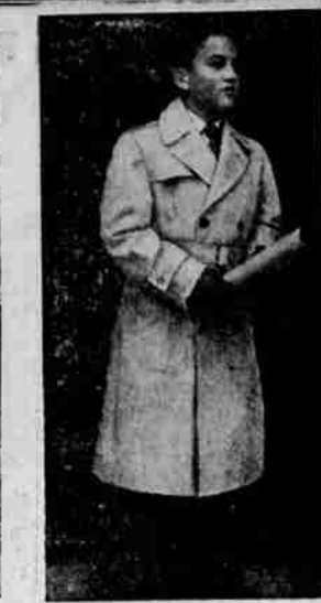
WASHABLE raincoat is made of gabardine, vat dyed and non-shrinkable. Lining is washable, too.