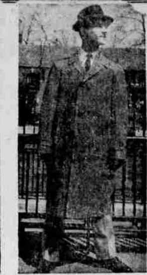
OVERCOATS at high school follow Dad's styles. This one's all-wool, has balmacaan collar, raglan sleeves.