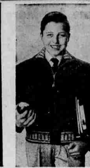
SMART and warm. Waist and neck are hugged tightly to keep cold out, warmth in. By Sport Chief.