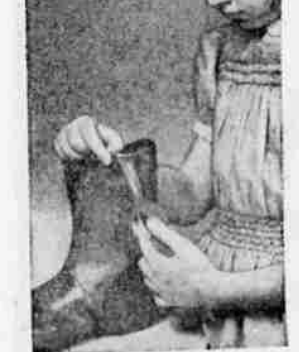
MENDING is simple with new plastic tapes. This gal's fixing her torn rubber boot.

A paper bag is an inexpensive lunch carrier, but do you have any idea what the banana looks like when Junior gets around to eating it?