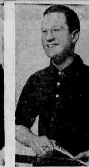
COMFORT and good looks: cotton knit sports shirt with club collar and short sleeves. By Van Heusen.