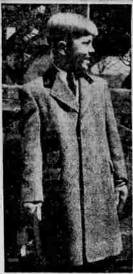
YOUNG gentleman in his wool Chesterfield, complete with velvet collar. Fabric is tan herringbone.