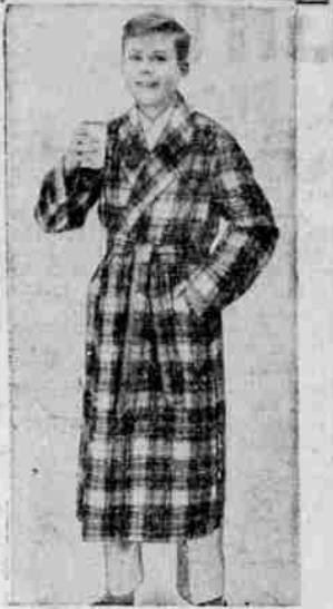
LOUNGING or coming down to breakfast, this Scotch tartan robe has deep pockets, shawl collar. By Rabhor.