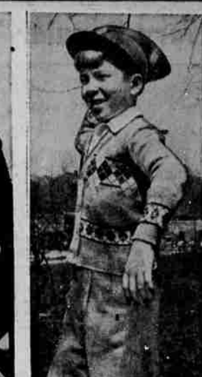
SWEATER is the trade-mark of the school boy. This cardigan is light gray all-wool for warmth and ease.