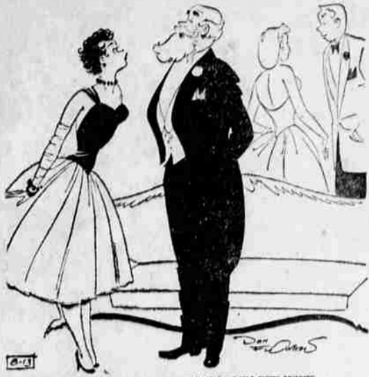
"Why, yes, Miss, I used to shave. But that was long ago."