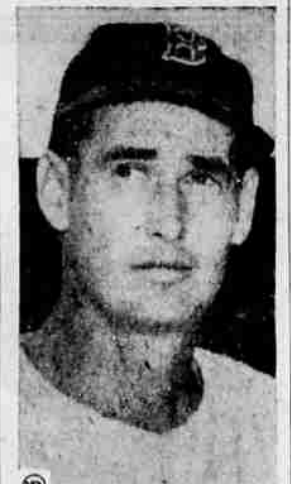
TED WILLIAMS ... "A Lousy Hit"