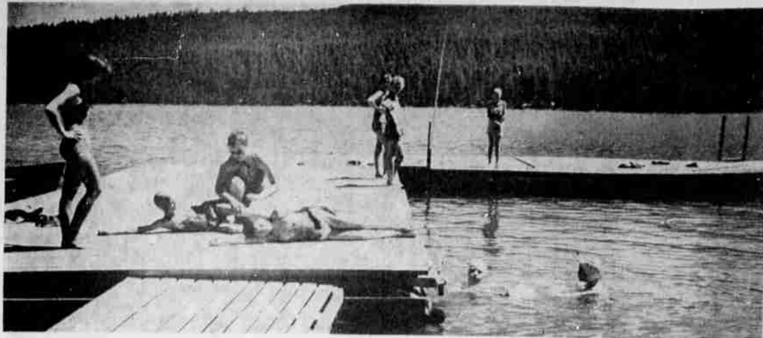
COOPERATION AND COORDINATION of efforts resulted in this big floating dock, finest on any water front on Lake of the Woods. The dock, completed recently, is at Camp Esther Applegate, used by Girl Scouts and Camp Fire Girls. It was built in the shape of an "L" of heavy timbers, atop 32-foot-long peeled red fir logs donated by O. K. Puckett. The hauling was donated by Leonard Putnam, Putnam Logging Company.