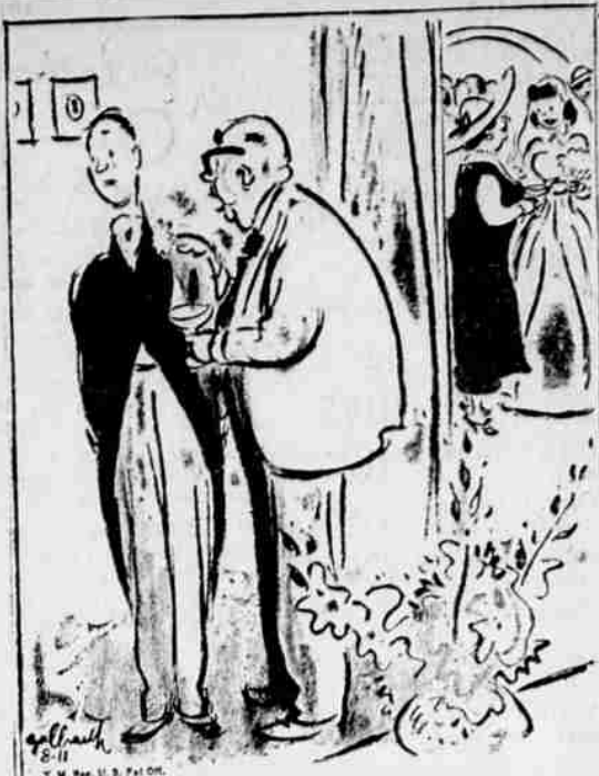
"Son, the first thing for you to settle with your bride is who's boss—no use kidding yourself!"

FISH COUNT PORTLAND — The upstream movement of fish past Bonneville Dam Tuesday: Chinook 379, jack 229, steelhead 2,061, blueback 18.