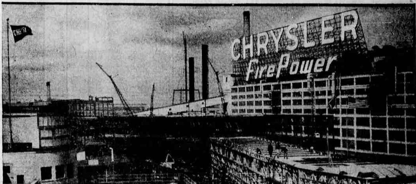
UP GOES CHRYSLER'S PRODUCTION MORE THAN 40% Here you see construction work proceeding on the new Chrysler production facilities which will add 667,000 square feet of floor space... including a 14-mile long continuous conveyor system, longest in the industry.

Fun Galore -- That's For 'Shore' Sponsored by all Klamath Basin Masonic Bodies