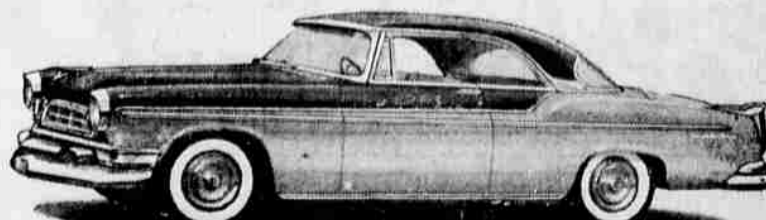
All Chrysler Cars are V-8's... with the most powerful type of V-8 engine on the road!

USED CAR BUYERS! Our "Pennant Winners"—which include many late model Chryslers—are the greatest buys in town!