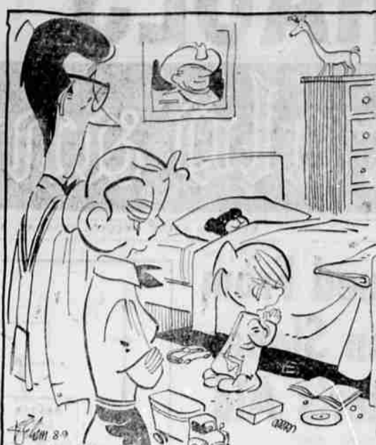
"GOD BLESS MOM 'N' DAD AND THE GUY THAT FIXES OUR TV..."