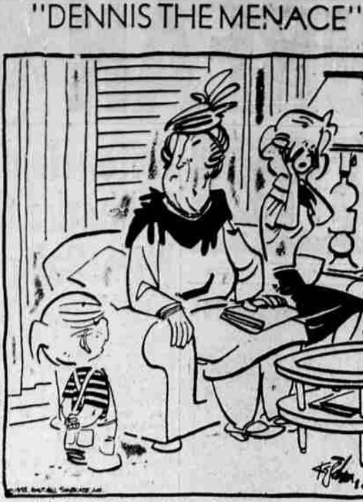
"I HEAR YOU GOT TWO FACES."