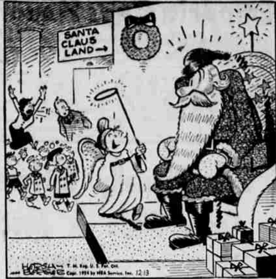
"Good night! He's wearing his sister's cantata outfit and asking for a motor scooter!"

Work has been slowed by freezing weather.