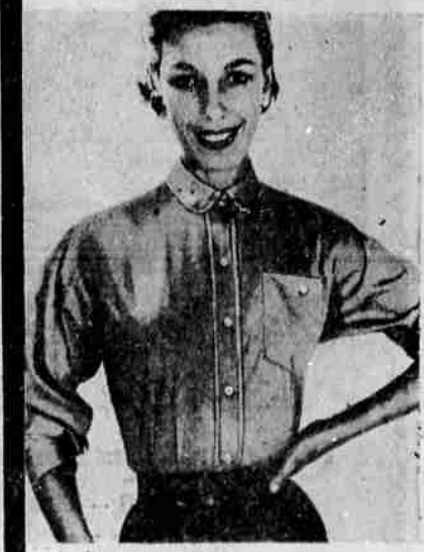
Pert Peter Pan shirt style with elbow sleeves. White, turquoise, aqua, apricot Dazzle cotton. 32 to 38. 2.98