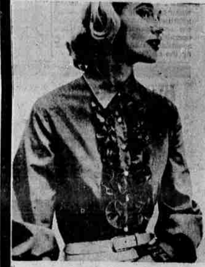
Gentleman's shirt; a dandy with ruffles. White, pink, orange, turquoise Dazzle cotton. 32 to 38. 2.98