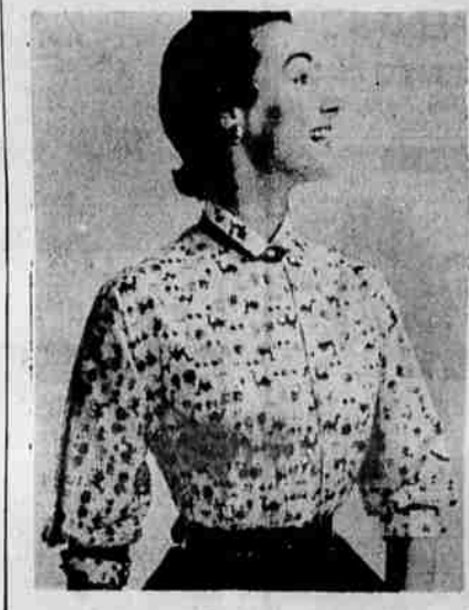
"Camels are Coming" print with contrast trim. Orange, purple or brown on white cotton. Sizes 32 to 38. 2.98