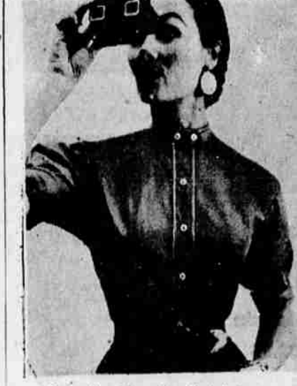
Dog-collar shirt style with doll sleeves. White, olive, orange, turquoise Dazzle cotton. Sizes 32 to 38. 2.98