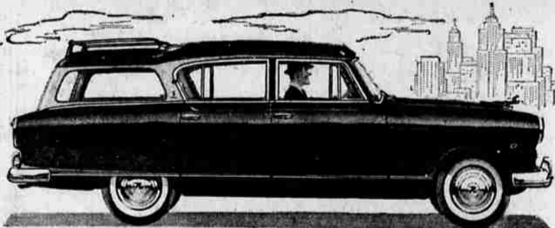
New 1955 Rambler Cross Country