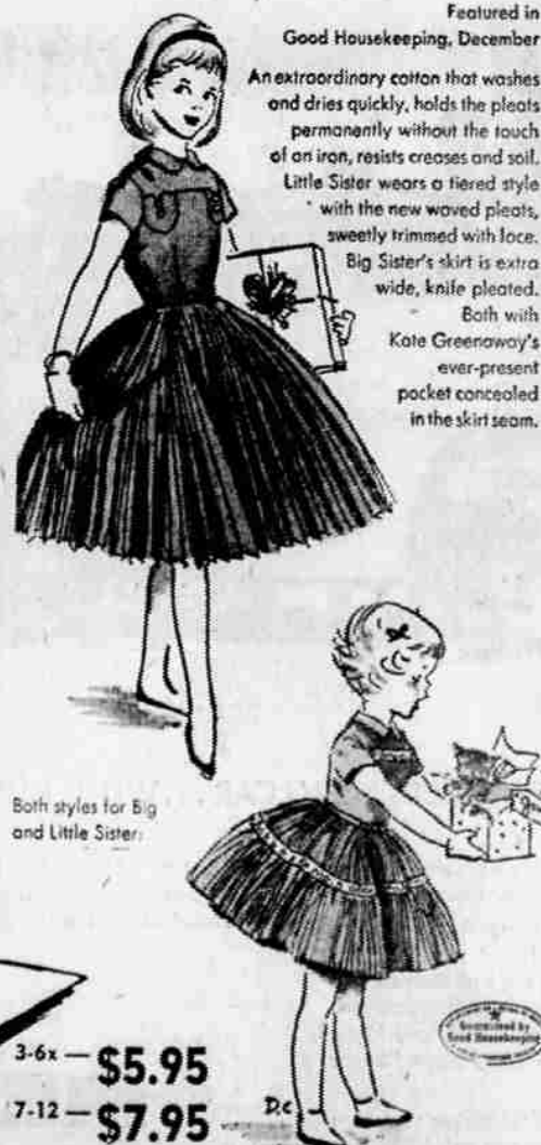
Both styles for Big and Little Sister.