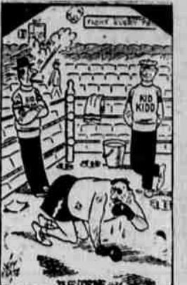
"Find 'em yourself! I ain't lookin' for no teeth for you to put under your pillow tonight so the fairies will bring you money!"