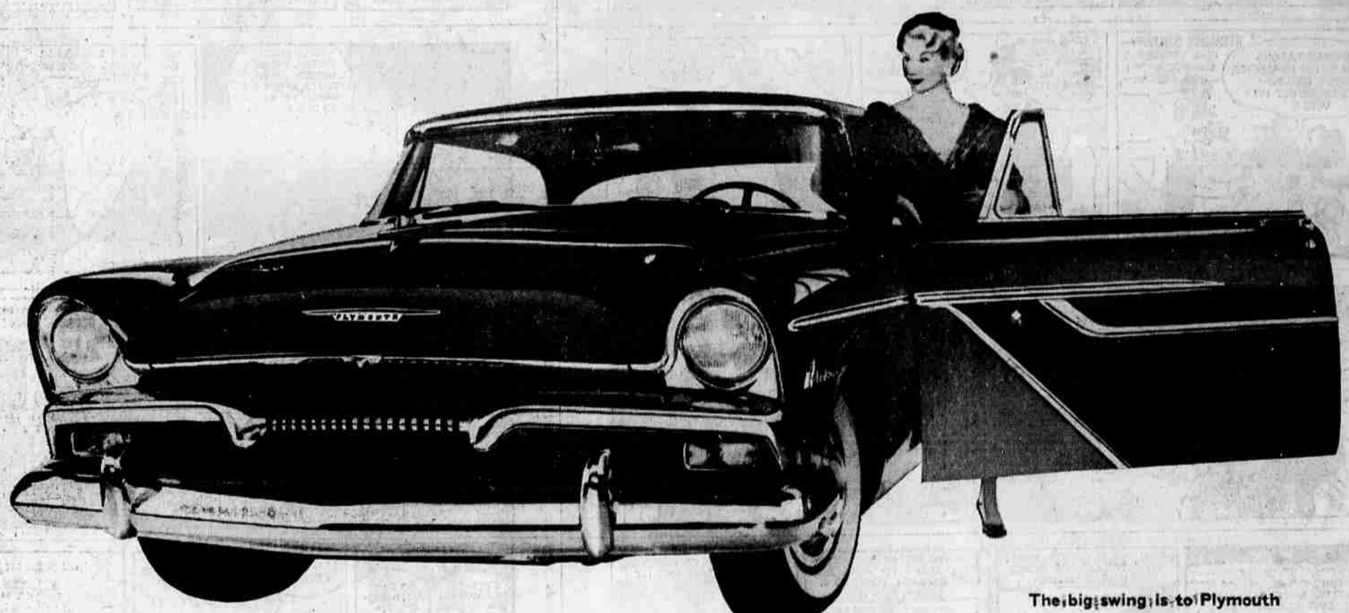
The big swing is to Plymouth