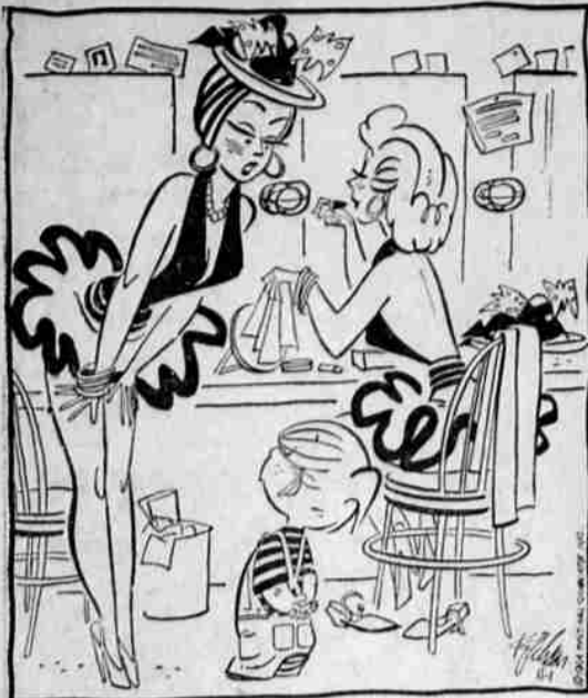
"DID YOUR DADDY SEND YOU IN HERE SO HE CAN COME AFTER YOU?"