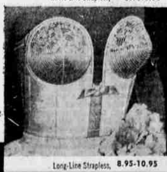
Long-Line Straps, 8.95-10.95

V-ETTE Whirlpool BRAS Buy them because... your curves will be cupped to perfection... more natural, healthier split... molded uniform control... shape-holding after many washings. The Whirl's the WHY!