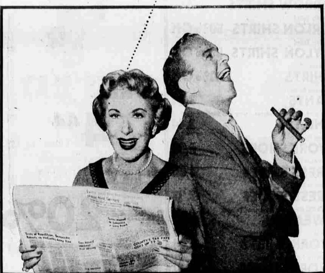
See the Burns and Allen Show Monday 8:00 P.M. on the CBS TV Network

Well, they could be coming out with a seven-cylinder car!