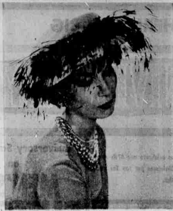
DRAMATIC HAT in ophelia pink velvet has bloused crown and is veiled in black ostrich sparkling with black sequins. By Sophy and Scotty, from The Velvet Institute of America.

It was announced Tuesday that Eisenhower will add another talk to his pre-election schedule—a nationwide TV-radio political broadcast from Washington Oct. 28.