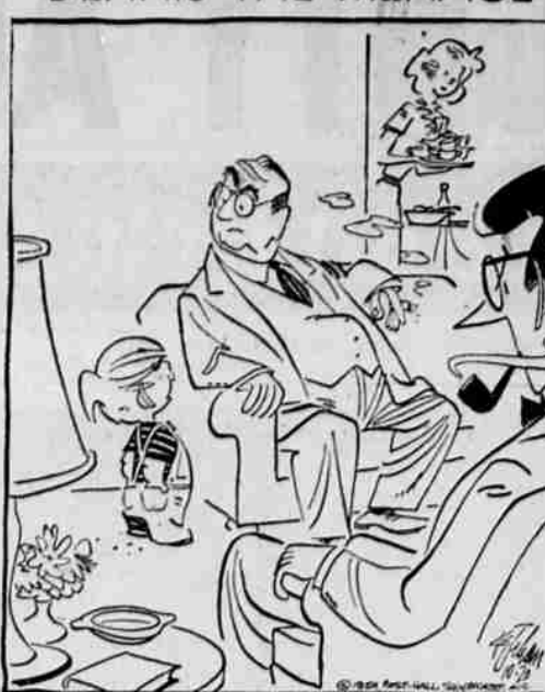
"BOY, I'LL BET YOU DRANK ALL YOUR MILK WHEN YOU WERE LITTLE!"