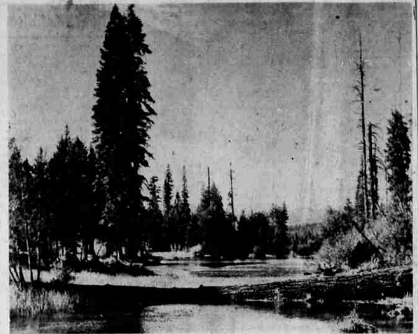
WITH FALL WELL ON THE WAY and winter around the corner it's sometimes pleasant to look back over the summer scenes. This shot was taken last month at the lower end of Kimball State Park, located at the foot of Sun Mountain. Wood River bursts from a spring here, tall pines shade the clear water and provide a cool resting place for those seeking outdoor enjoyment. A good deal of cleanup work is needed at the park to bring it to top shape and it is hoped that this can be carried out in the spring.

"I don't think the people want to abandon these humanitarian services. We are trying to do a realistic job of administering the money for these services and outside experts tell us Oregon is doing one of the best jobs in the nation, particularly in the welfare department," he said.