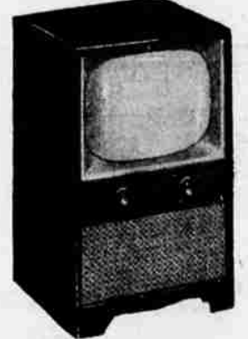
NEW 21" MODEL—REG. 199.95 179.88 With year warranty.

Take the work out of washday with this fast, efficient M-W Deluxe Washer. Washes 8-9 lbs. with 6-vane Swirlator action. Lovell wringer swings to 8 positions. Automatic drain pump. Ask about Terms.