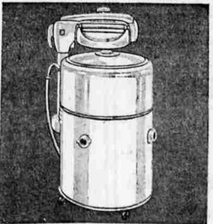
REG. 133.40 WASHER 126.95

This popular M-W Freezer offers you greater capacity at less cost per cu.ft. than previous M-W models. Two freezing compartments hold 542 lbs. of frozen food—2 dividers, 2 baskets and utility tray let you store it systematically, keep everything in easy reach. Special construction ends annoying cabinet sweating. Easy-to-open, counterbalanced lid—lifts with finger-tip pressure to any desired position and stays there. Ask about Terms.