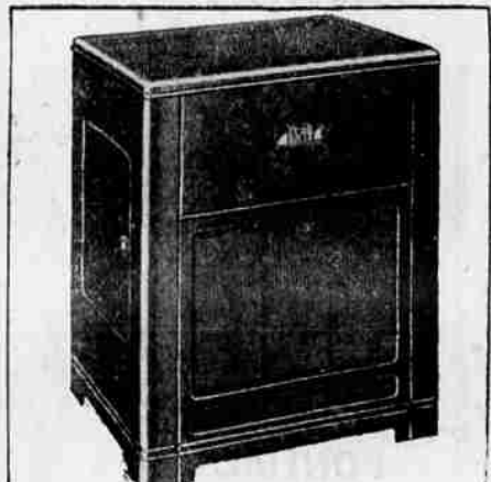
101.72 HEATER—THERMOSTAT 85.77

Now at low sale price—3-4 room Oil Heater and Electric Thermostat for automatic heating. Oval burner has economy pilot flame—light it once and forget it. Shadowed mahogany baked-on enamel finish.