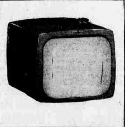
17" TV—REGULAR 139.95 129.88

Big screen TV with a steady clear picture and sound the way you like it—full-bodied and static-free. Performs equally well in a fringe area. Mahogany finished cabinet harmonizes with fine furniture.