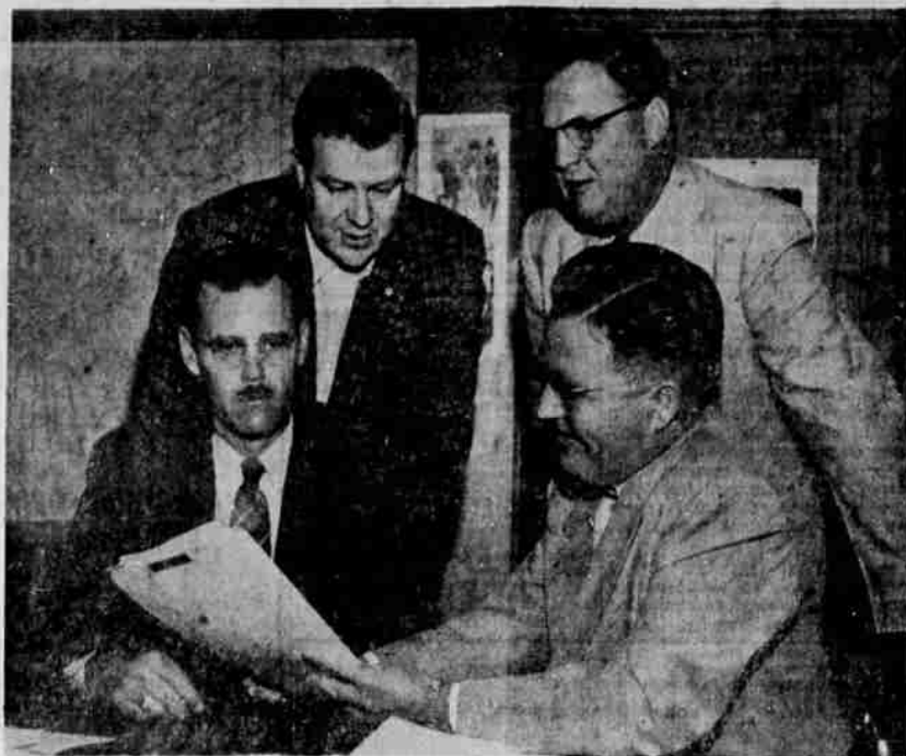
FINAL PLANS for the annual YMCA dinner to be held Thursday, December 9, at the YMCA, were discussed earlier this week when the dinner committee met for luncheon at the Winema Hotel.

CHICAGO GRAIN CHICAGO (AP) — Grains sold off on the board of trade Tuesday with soybeans down more than five cents at times. Dealings were fairly active.