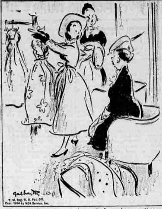
"I may decide on a career instead of marriage, mother—I don't like any of the house dresses I've seen this fall!"