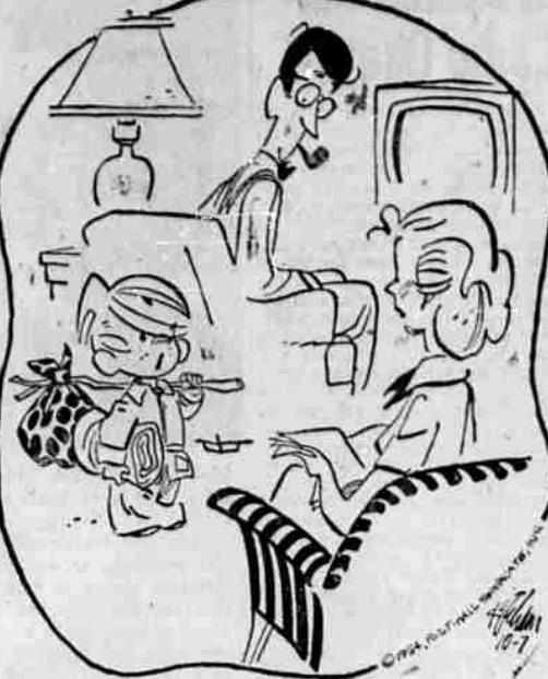
*IN CASE YOU THINK I FORGOT MY TOOTHBRUSH, YOU'RE WRONG! I LEFT IT!