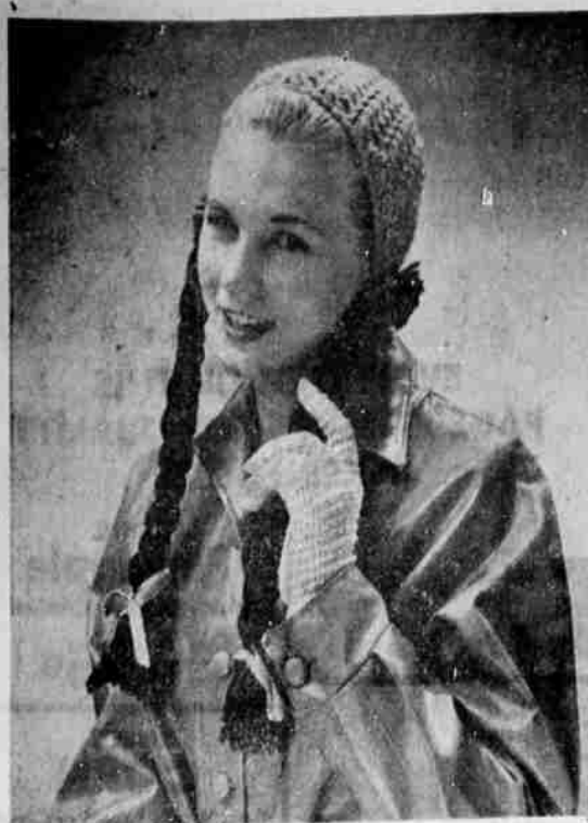
PIGTAILS ARE BACK. But today's coeds aren't growing their own. Latest fashion is to have them sprouting right out of the hat, as in this hand-crocheted wool cap by Veumont, with long yarn braids and a perky bow at the end of each. Spreading from campus to campus, too is the specialized fed of wearing the "pigtail" cap in individual school colors. Veumont hand-crocheted caps are available locally.