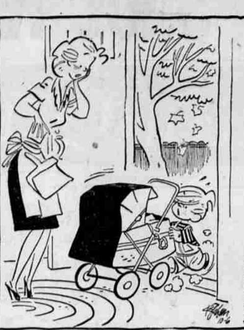
"LOCK THE DOOR! HIS FOLKS MAY TRY AN' GET HIM BACK!"