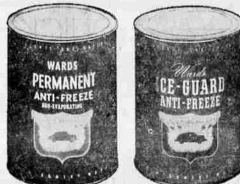
WINTER MOTOR PROTECTION 1.98 Gal.

24-month guarantee. Sure Winter starts. Fits Ford-Merc. from '40, Chevrolet from '40, Dodge-Plymouth from '36, K-F from '47, most Nash from '39, Studebaker from '39, Willys from '37. *Plus your battery.