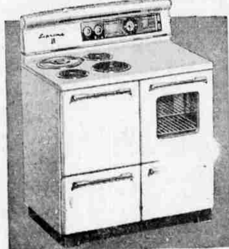
287.95 ELECTRIC RANGE 267.88

Picture is bigger-looking than other 17" sets because front of the cabinet is all picture. All controls are on top—you don't have to stoop to tune channels. Performs well even in fringe areas.