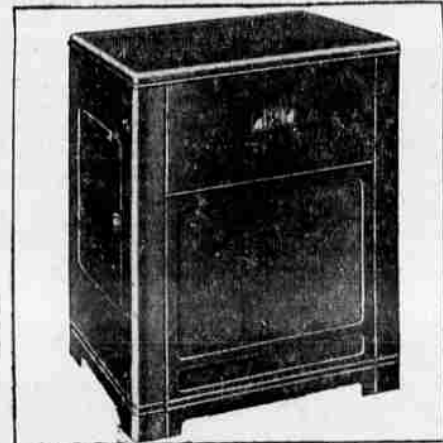
101.72 HEATER—THERMOSTAT 85.77

Now at low sale price—3-4 room Oil Heater and Electric Thermostat for automatic heating. Oval burner has economy pilot flame—light it once and forget it. Shadowed mahogany baked-on enamel finish.