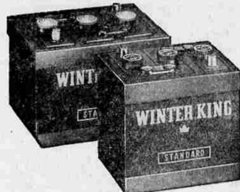
SALE—STANDARD BATTERIES 9.97

Big 40-in. M-W Range with Finger Tip control. Each top unit and deep well cooker is controlled for 7 heat speeds. Fully automatic electric clock controls oven, deep well, appliance outlet—turns them on and off.