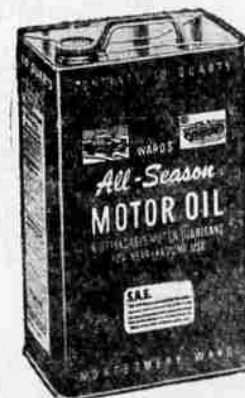
SALE—ALL-SEASON OIL 20 Ots. 4.07 Tax incl.

Wards Permanent Anti-Freeze ends your radiator worries for a full winter season. Won't boil away or evaporate—special non-corrosive ingredients. ICE GUARD ANTI-FREEZE... 88c Gallon