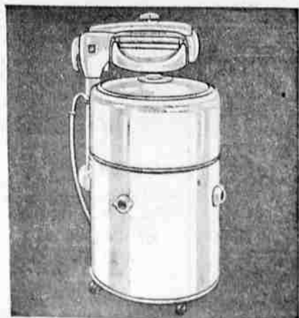
REG. 124.95 WASHER 119.88

Now at low sale price—3-4 room Oil Heater and Electric Thermostat for automatic heating. Oval burner has economy pilot flame—light it once and forget it. Shadowed mahogany baked-on enamel finish.