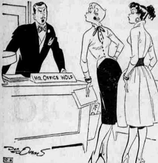
"Who changed the name plate on my desk?!"