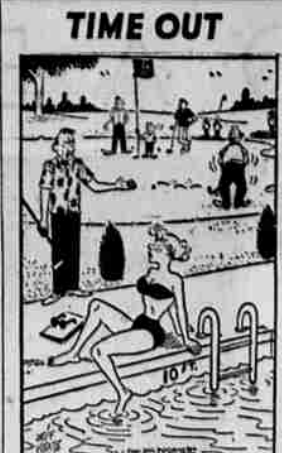
"Mind going in the pool a minute, miss? I'd like my partner to at least 12-put this hole!"