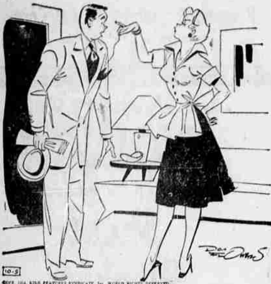
"Of course it's a blonde hair. Remember, you've been blonde all this week!"