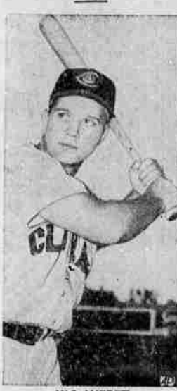
VIC WERTZ ... HITS FOR INDIANS

CLEVELAND (AP) — The New York Giants, with amazing dusty Rhodes again in the starring role and pitcher Ruben Gomez giving line support, whipped the Cleveland Indians, 6-2 Friday for their third straight victory in the World Series. Rhodes equaled a World Series record by hitting safely for the third straight time as a pinch batsman.