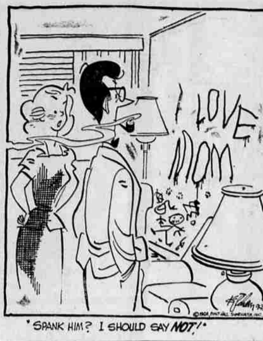
"SPANK HIM? I SHOULD SAY NOT!"