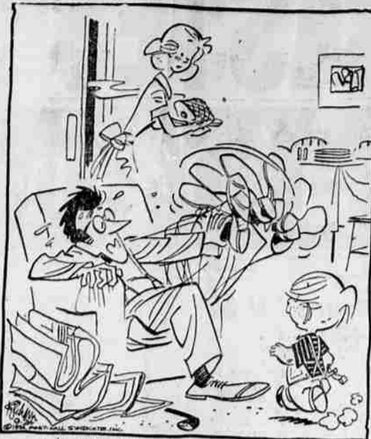
"YOU FOUND HIM, DAD! GOOD FOR YOU! I THOUGHT THAT FROG WAS LOST!"