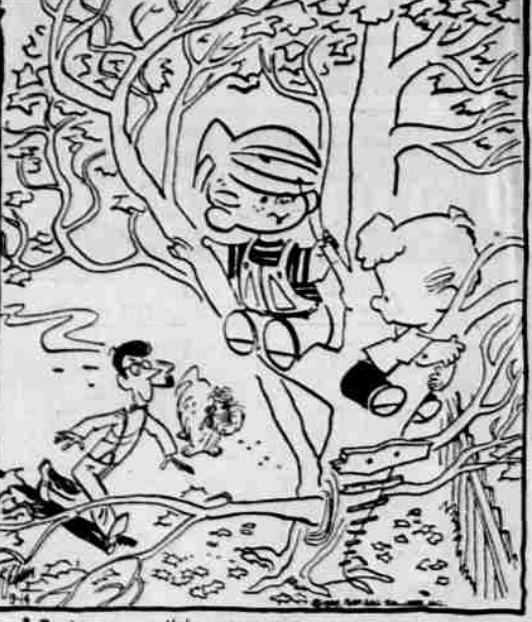
"DON'T WORRY, HE'LL MAKE A LOT OF NOISE, BUT HE'S TOO OLD TO CLIMB UP HERE."