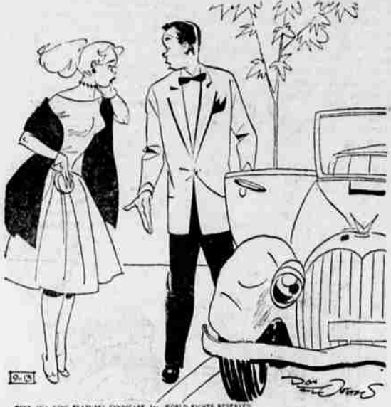
"But, Barbara, this IS my dad's car!"