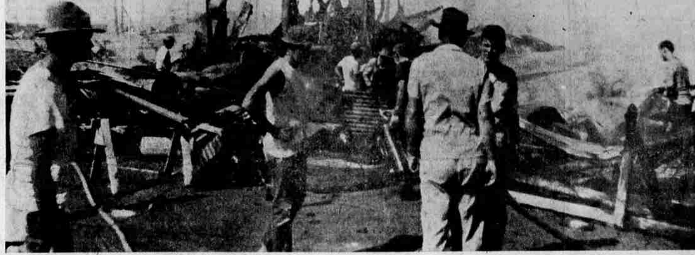
WITH LIGHTNING-LIKE SPEED flames destroyed the Spangler Lumber Co. sawmill at Bly. Charred ruins of the mill are shown in upper photograph. The fire in its final stages is pictured below. Bill Hayden, superintendent of the plant, is shown with his back to the camera. Whether the sawmill will be rebuilt has not been decided.