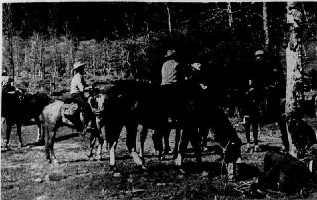
ALL SET TO HIT THE TRAIL FOR HOME , and that's just what these members of the Alturas Tribe Ride were about to do when this picture was snapped. The Tribe, some 24 strong, left Alturas on August 19 for their annual ride and returned on August 22. The trail lead over the hills and down the canyons to Mill Creek where a permanent camp is situated. Some riders went to the top of Eagle Peak, highest spot (just under 10,000 feet) in Modoc County, while others fished, loafed or hiked. This picture was taken at the lower end of the Mill Creek camp just opposite the ford in the creek.