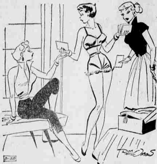
"And this is that handsome lifeguard I told you about, giving me artificial respiration—"