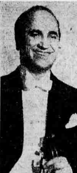
RUBINOFF AND HIS VIOLIN