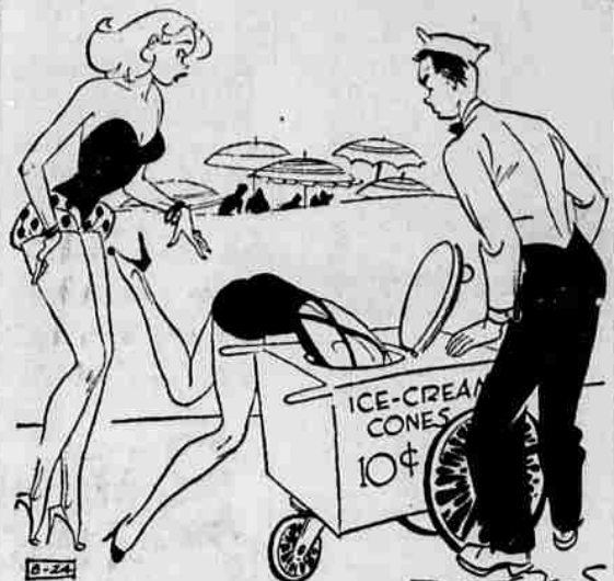
"Geraldine! The man says he's all out of vanilla!"