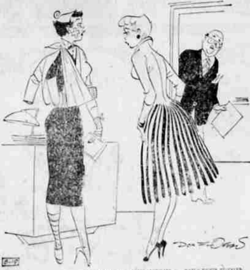
"It was a marvelous vacation, up to a point."