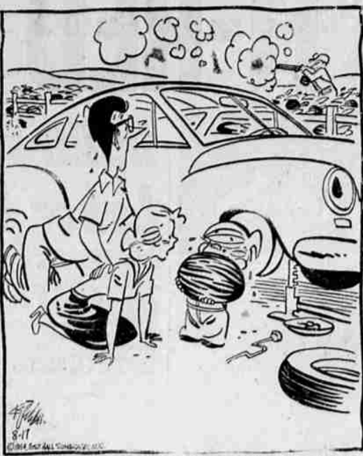
DIDN'T I TELL YOU TO STAY IN THE CAR WHILE DADDY FIXED THE FLAT?