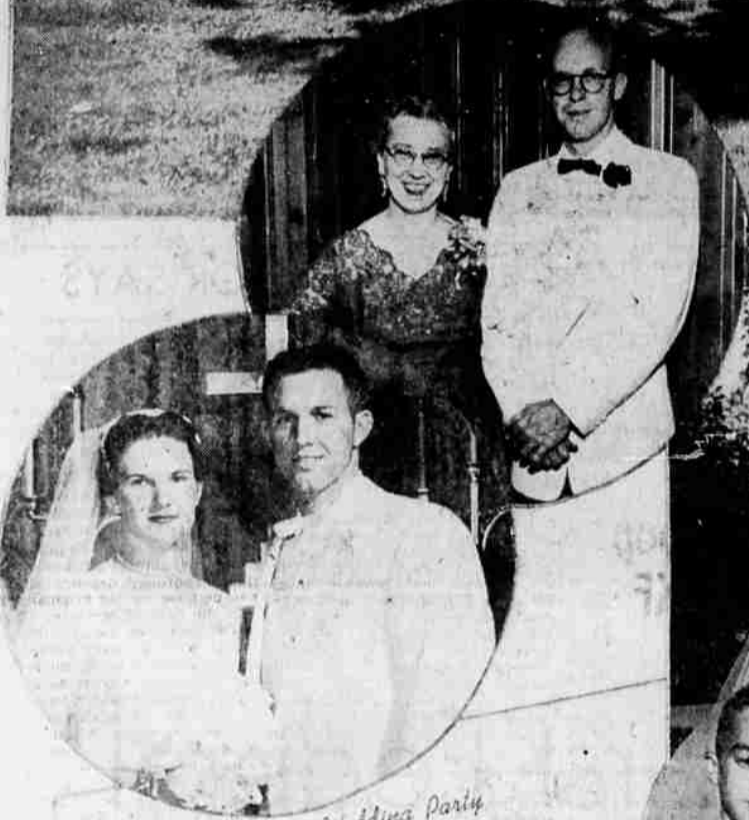
The Wedding Party