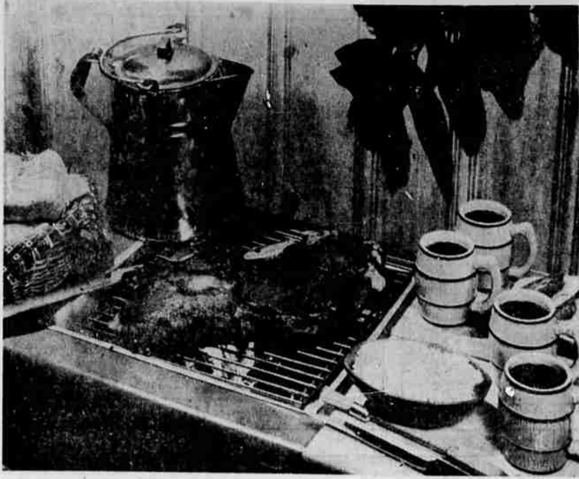
A THICK, JUICY STEAK , broiled outdoors to sizzling perfection, is probably the ultimate in open-air eating and well worth a budgetary splurge. Anointed with garlic-butter steak sauce, accompanied by hot rolls, chilled fresh tomatoes and slices of cucumber and onion, it provides an easy-to-prepare meal that's hard to beat. Real steeped picnic coffee, of course, is a must.