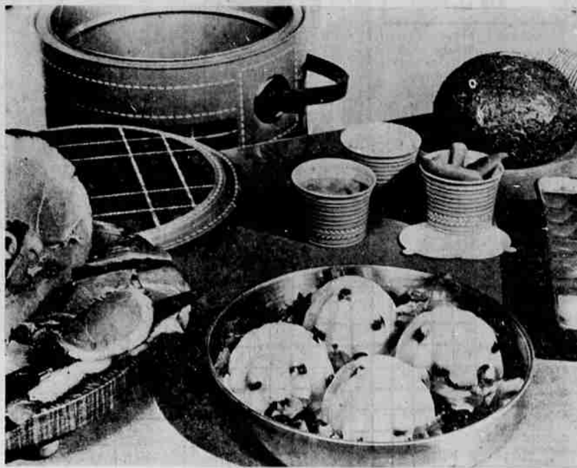
BLUEBERRY CHEESE SOUFFLE SALAD is a new departure in picnic fare, made possible by modern picnic equipment such as the Scotch Kooler that transports it safely and coolly to woods or shore for outdoor eating enjoyment.

Write Fairgrounds or Chamber of Commerce, Yreka, Calif., for entry blanks.