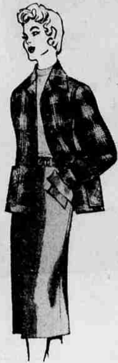
FASHIONABLE FALL JACKETS