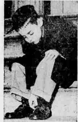
ADULT CONSTRUCTION as well as styling is reflected from the brown calf military-strap oxfords this grade schooler is wearing. They are by Endicott Johnson. "Grown up" trench coat and slacks are Twigs fashions.