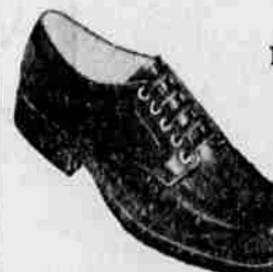
GREADIER BOYS' OXFORDS

These colorful socks are knit for long wear. Mercerized cotton is absorbent, comfortable. 8 1/2 to 11.