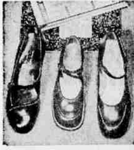
THREE NEW VERSIONS of the ever popular pump for girls going back to school, left to right: smooth black leather by Lucky Strides; two in one strap in red leather by Stride Rite; smart single strapper in blue, by Sandler of Boston.