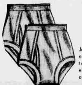
BOYS' SPEED SHORTS

Styles for ramping boys and girls. Detachable button suspender jeans in sturdy Sanforized blue denim. Front zipper fly for boys, side zip for girls. Sizes 1-6X. FLANNEL SHIRT—Softly napped Sanforized cotton flannel. Colorful fall plaids. Sizes 2-6X.....1.29