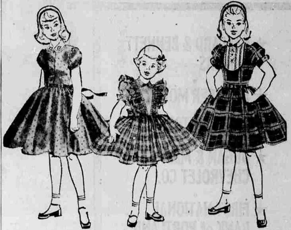
JUST ARRIVED AT WARDS—NEW FALL COTTONS FOR GIRLS

Washable wool and nylon blend cotton-front jackets in fall plaids and bright solid colors for wear at school or play. Button cuffs. Sizes 10 to 20. SKIRTS, 100% wool flannel, 22-30 . . . . 5.98