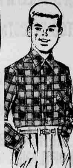
BOY'S SPORT SHIRT

Styled to delight young schoolgirls. Fine snowy-white cotton Blouses that boast style and beauty. Smooth Sanforized broadcloth with embroidered floral accents, neatly tucked front, Peter Pan collar. Washable. Come see them at Wards today. Select several. Sizes 7-14.