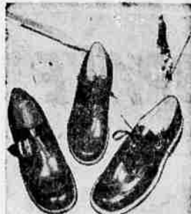
FOOTWEAR WARDROBE for the boy going back to school includes wide style variety as shown above left to right: U-Wing with monk strap and shiny buckle, by Stride Rite; duplicate of laced oxford like dad wears, by Red Goose; perforated wing tip model featuring black leather sole with white wetting, by Simplex Flexies.