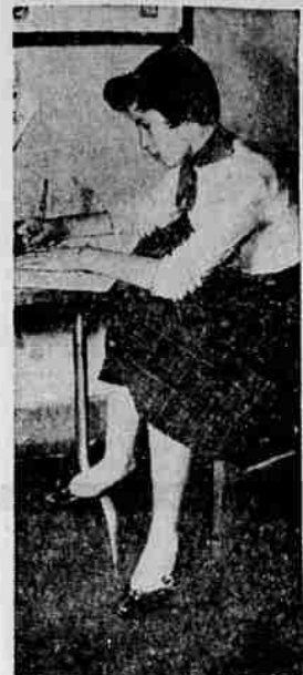
FASHION PROPOSES for sub-teen and teen agers too, blue leather pumps with perky little white and blue leather bows. This model by Sandler of Boston.

Sturdy, rugged Oxfords styled just like Dad's. In supple brown leather with long-wearing soles. In sizes from 2 1/2 to 6.