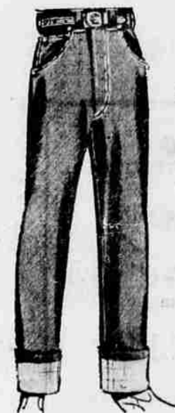
WESTERN SADDLE PANTS

Two Jackets in one. Popular for sport wear now and right through fall. Sleek rayon-acetate satin in blue, green or red reversing to medium gray cotton twill. Completely water repellent. Each side has two roomy pockets. Knit waistband, collar, cuffs. Sizes from 4 to 8. 10 to 18 — 7.49