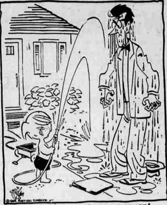
"I FELT SORRY FOR YOU. YOU LOOKED SO HOT."