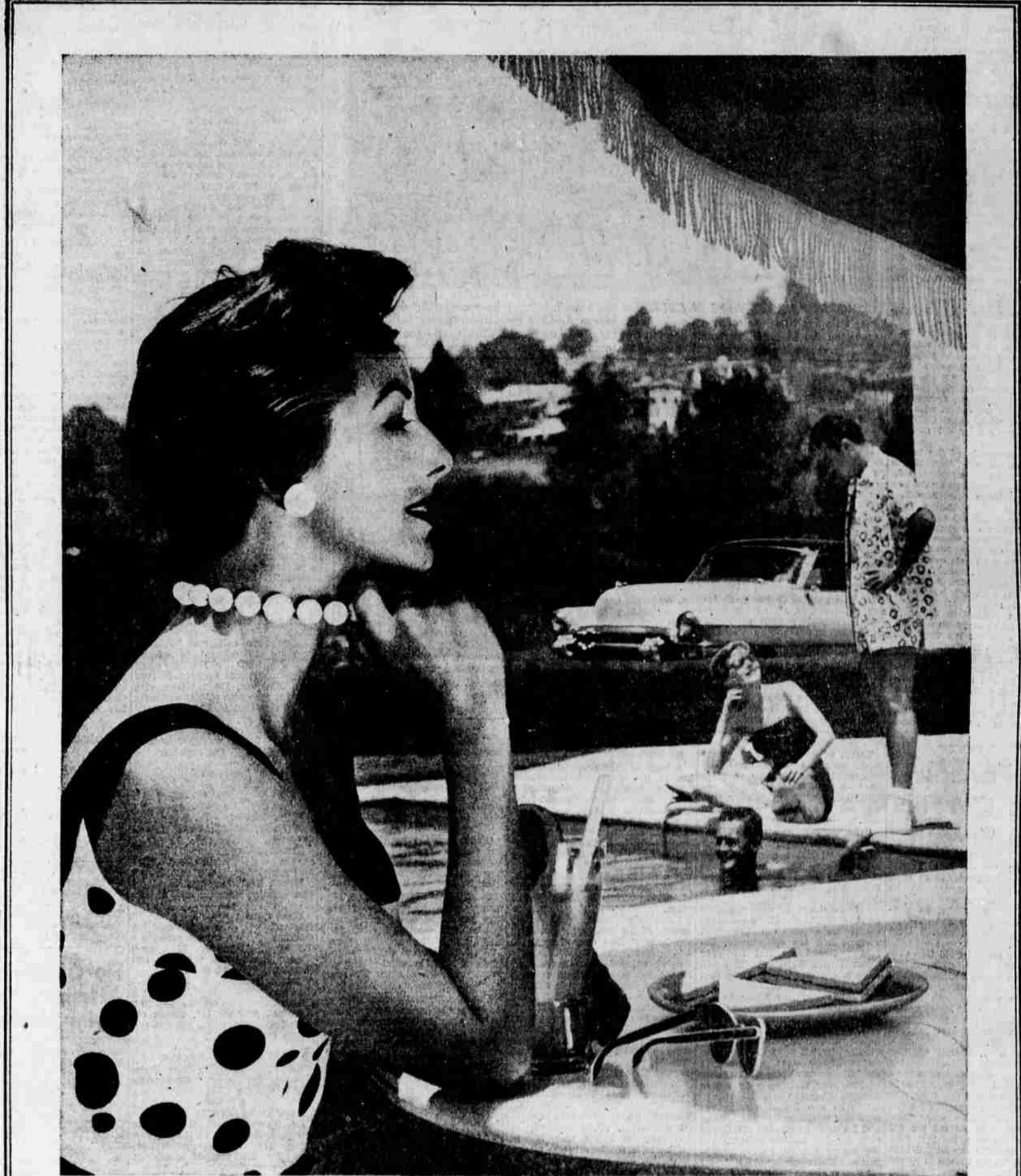
Clothes by Saks Fifth Avenue, Beverly Hills